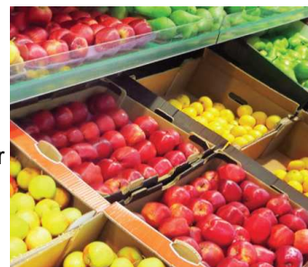
Ticket & Label Printing