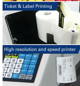
High resolution and speed printer