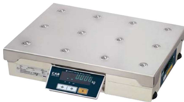
Dual Display With Ball Type Platter ▲